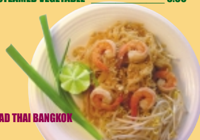
PAD THAI BANGKOK