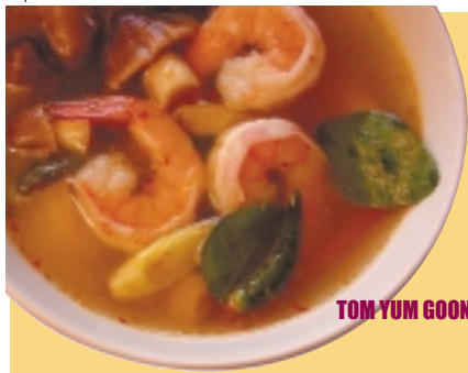
TOM YUM GOONG