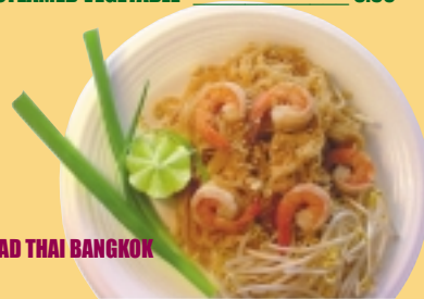
PAD THAI BANGKOK