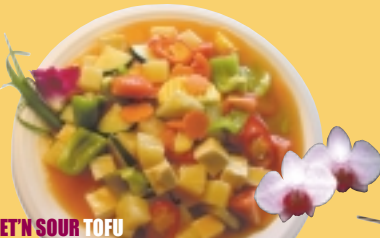
SWEET'N SOUR TOFU